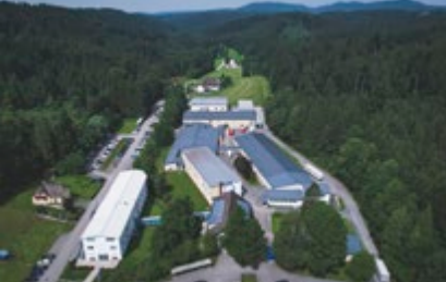
Installation of rooftop solar (PV) unit resulted in a greenhouse gas reduction of 50 metric tons

We set up an internal "shark tank" fund to support carbon reduction projects and in 2021 this mechanism financed projects that we anticipate will reduce our greenhouse gas emissions by over 11,000 metric tons. This fund has been continued to finance 2022 reduction projects and we are starting to see the impact of these projects.