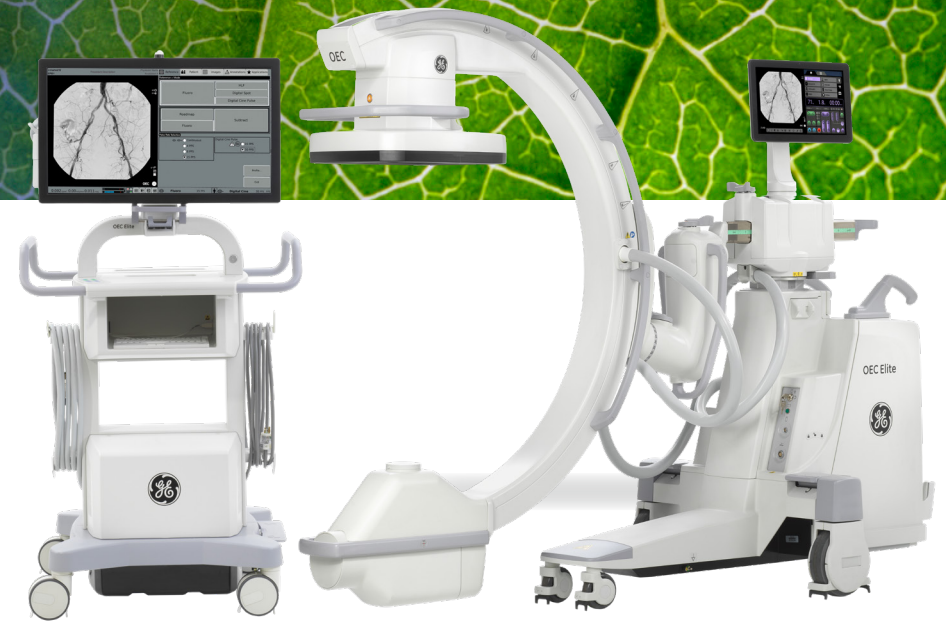
OEC™ Elite CFD premium mobile C-arm