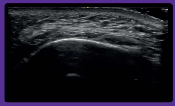
Evaluating placement of filler